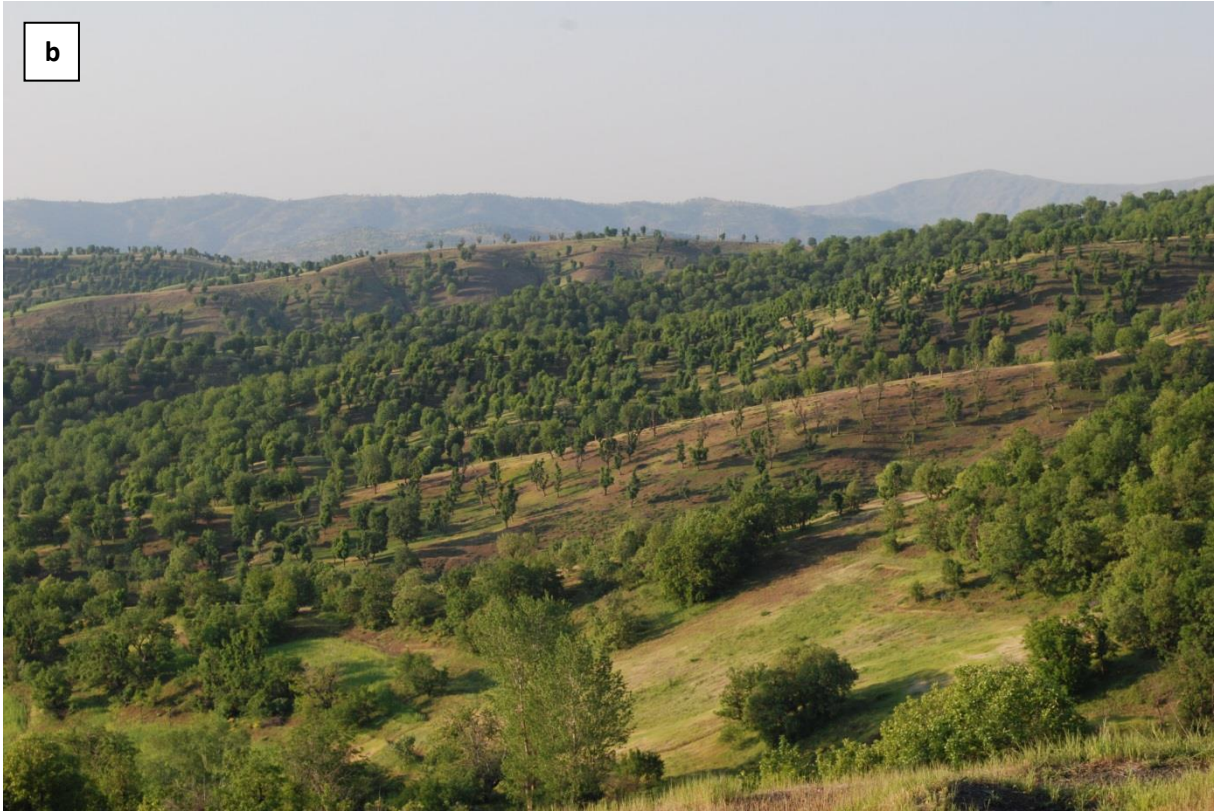
Figure A1.1: (a) A sacred grove surrounded by traditional farmland and woodland and (b) Silvopastoral woodland of traditionally pollarded oaks.