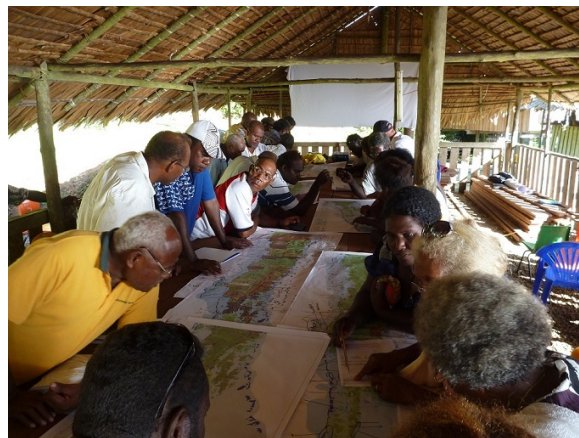
Fig. 3. Participants in the “Ridges to Reefs” conservation planning workshop, Kia, Santa Isabel, Solomon Islands, March 2012.

Workshop participants then broke into three groups based on their region. Each group was provided with a key for the 87 ecosystem resources and large color base maps at 1:70,000 scale showing their customary estates with terrestrial and reef data, rivers, roads, and villages. Participants then used their local knowledge to mark the location of the ecosystem resources within their customary lands and seas (Fig. 3). In a sense, this involved the construction of a cultural landscape map. Participants were then asked to plan out a conservation program. They first determined what percentage of the ecosystem resources they would like to see conserved across Isabel Province by assigning a low and high value to each ecosystem resource, reflecting the range of views held by the participants as to its value.