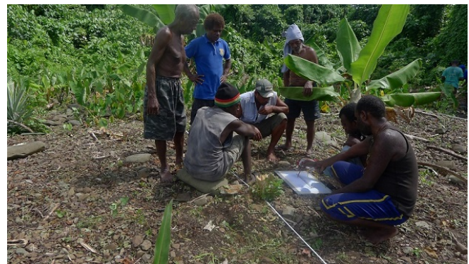
Fig. 4. Participants in the Sukikki Cultural Heritage Workshop recording a cultural heritage site. Guadalcanal, Solomon Islands, November 2012.

Marxan was then used to assist with designing a series of maps showing what an Isabel Ridges to Reefs Protected Area Network could look like under a range of low-high conservation scenarios (Peterson et al. 2012). Marxan is a decision support tool developed specifically to assist with complex conservation planning problems (Possingham et al. 2000). Because cultural heritage targets were set at 100%, the Marxan software set conservation priorities that captured varying percentages of natural resource targets and all of the cultural heritage targets identified by Isabel stakeholders that had clear and discrete spatial referents. It did not account for the multitude of landscape features that either were unable to be spatially identified for cultural reasons or did not have a clear spatial reference, e.g., the wandering tracks of souls passing to the afterlife. The challenge for us as conservation planners is to develop models of landscape that as closely as possible approximate those of the Isabel communities with whom we work. Marxan software helps, but it must be supplemented by grounded, community-led ethnographic and historical research.