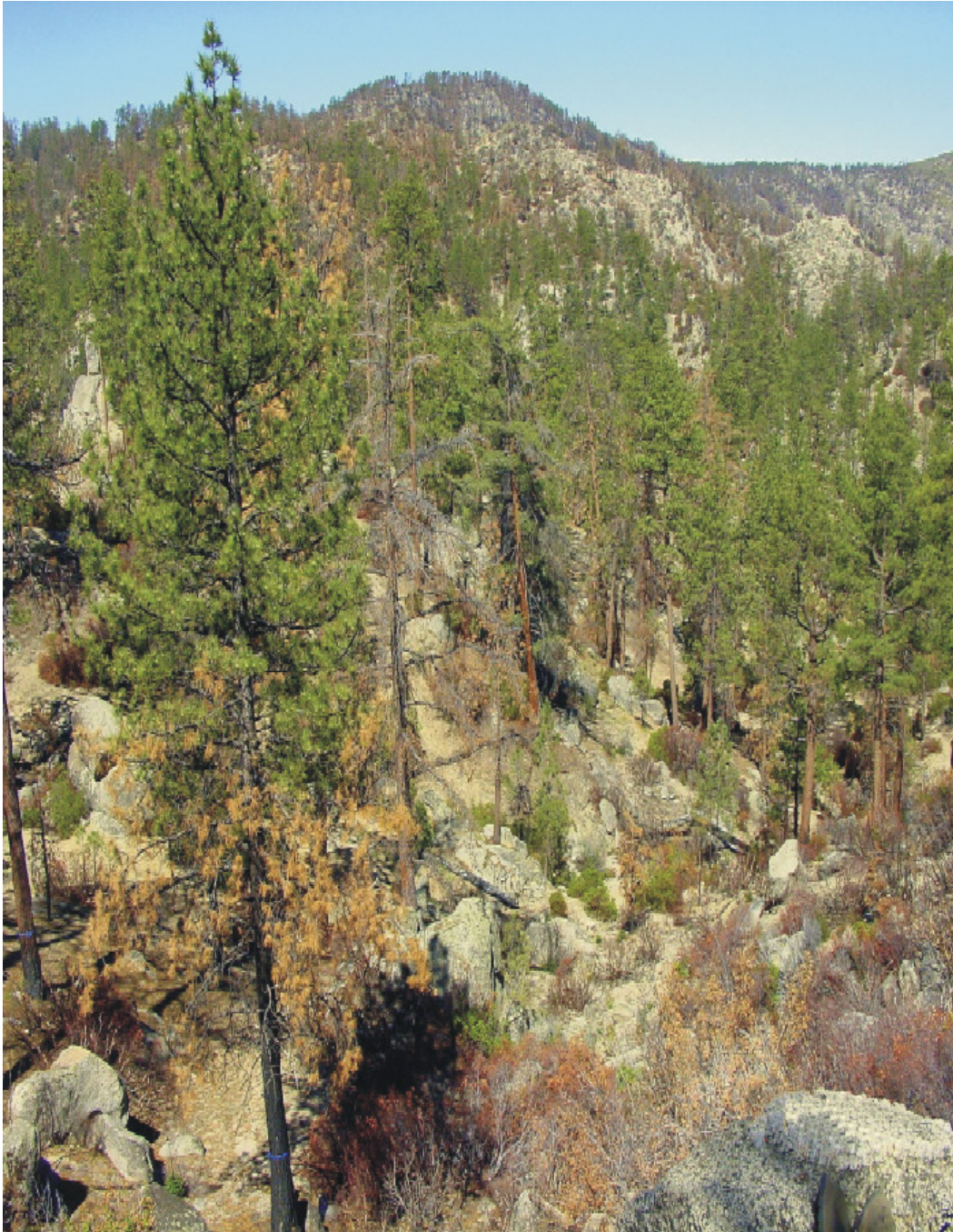
Fig. 1. This photo of an unmanaged Jeffrey pine-mixed conifer forest was taken 3 yr after a 2003 wildfire in northern Sierra San Pedro Martir (SSPM), northwestern Mexico, the first fire in this area in several decades. Observations of average forest stand characteristics, i.e., tree and snag density, basal area, fuel loads, are uncommon in these forests. This spatial heterogeneity is due to recurring disturbances such as fire, which influence landscape patterns.